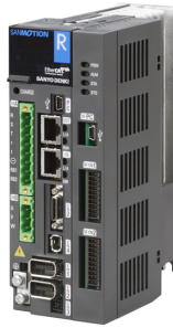
RS3A01A2HLE SAFETY DRIVE