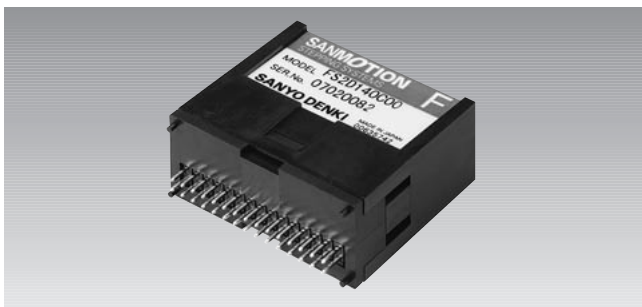
Fig. 1: Photograph of the driver

The developed product is housed in the plastic case and has pins at the bottom for inserting a PCB. At the top of the product, switches for various settings are laid out. Fig. 1 shows a photograph of the driver.