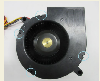
Outlet Drain Holes