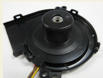
Epoxy resin coating of motor (IP68)